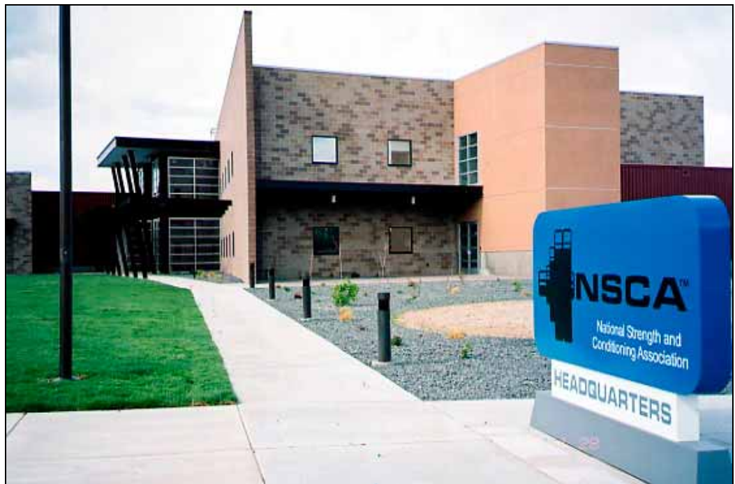
NSCA World Headquarters