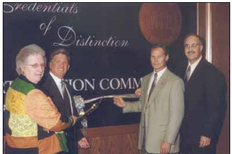
Dedication of NSCA Certification Commission building on September 20th, 2003.