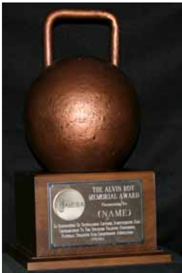
Original Alvin Roy Award first presented in 1986