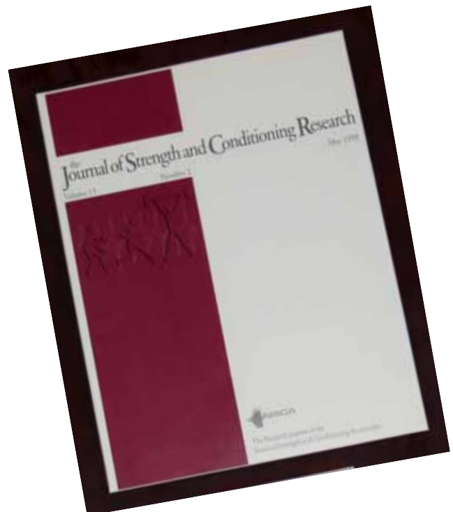
The Journal of Strength and Conditioning Research was published for the first time.