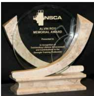
Current Alvin Roy Award