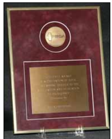
President Award presented first in 1986