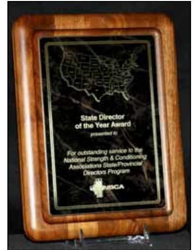
State Director Award is presented for the first time

1987, January - The Journal of Strength and Conditioning Research was published for the first time. This Journal helped "Bridge the Gap" between the practitioner and the sport scientist.